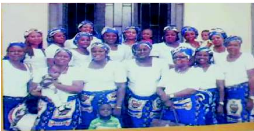
Plate 5c: Cross section of members of CWO, Church of the Nativity

On the 23rd of May 2004, elections were conducted and the following were officially elected as new officials and executives of the CWO for Church of the Nativity.