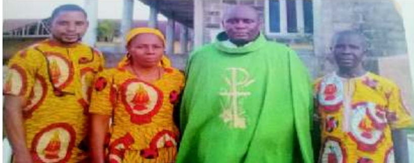
Plate 4p: Cross Section of Parish Priest with member of infant Jesus Society.