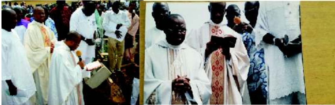
Plates 3d: The foundation blessing of the parish Presbytery