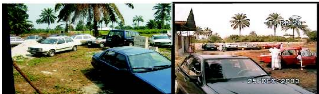
Plates 4b: Showing the car park and outside view of the out station during the first holy Mass of December 25, 2003