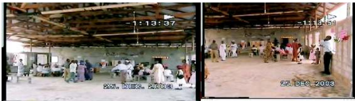
Plates 4a: Offertory session at Church of the Nativity on December, 25th, 2003

first pastoral council vice chairman had these to say “At that inception Mass on December 25th, 2003, the church was virtually an open hall with no pew or bench. A congregation of 33 persons was present at this first mass – 26 of them were from St. John's Rumuokwurusi and only 7 came from the immediate local community. The compound was full of tree stumps and very few vehicles managed to get into the uneven premises. It was not difficult to see the great challenges at a glance. These initial threats notwithstanding the congregation grew rapidly from 7 at the subsequent Sundays to 32, 43, and 120, and by July 2004 we had congregation strength of nearly 300 members.”