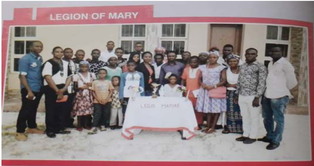
Plate R: Cross Section of Legion members

The Legion of Mary was inaugurated in the parish in 2004, with five members in attendance. This eventually became the first praesidium in the outstation as at then called Our Lady of Divine Grace praesidium.