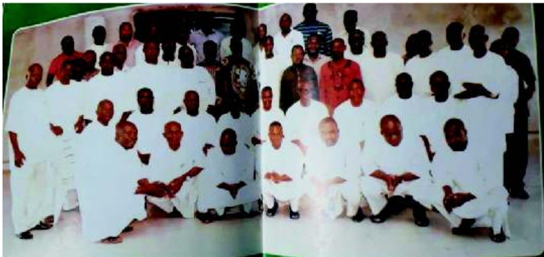
Plate 5b: Cross section of member of the CMO, Church of the Nativity