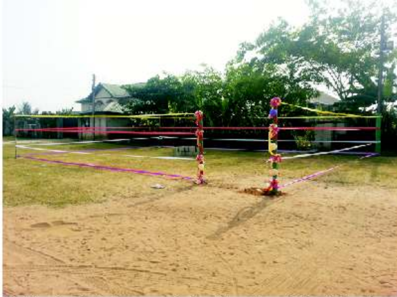
Plate 3k: Showing the land space marked out for setting and foundation of new parish church building.