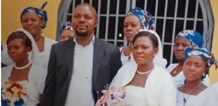
Mass wedding of 2013

Another group wedding was organized and sponsored by the parish in 2013, but this time, the turnout was low. Only two couples were wedded.