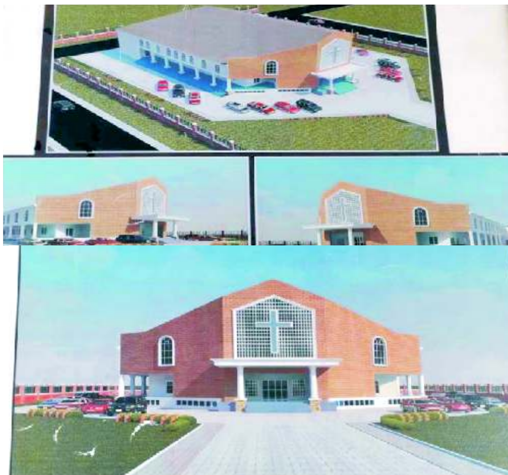
Plates 6: Architectural design model of the Church of the Nativity new building

An Architectural design and projection of the future looks of Church of the Nativity, Rumuewhara, Oroigwe