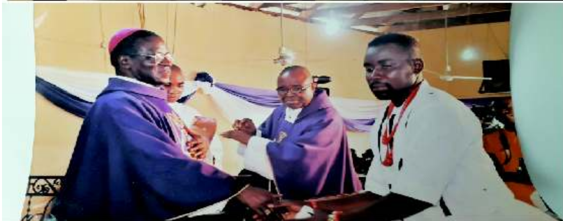
Plate 4j: Parishioners of the Church of the Nativity meet and greet His Lordship Bishop C.A Etokudoh