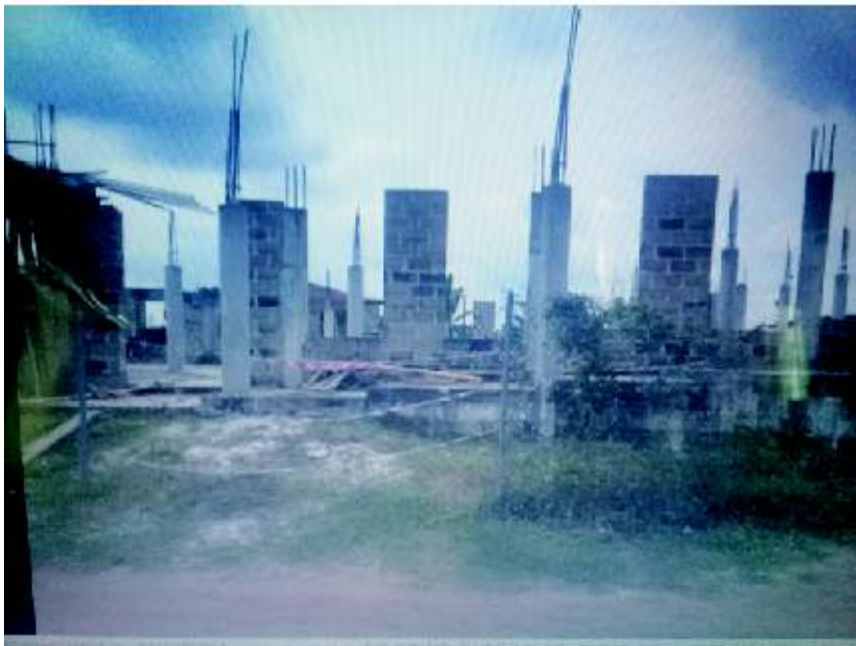
Plate 3l: Showing the new church building still under construction