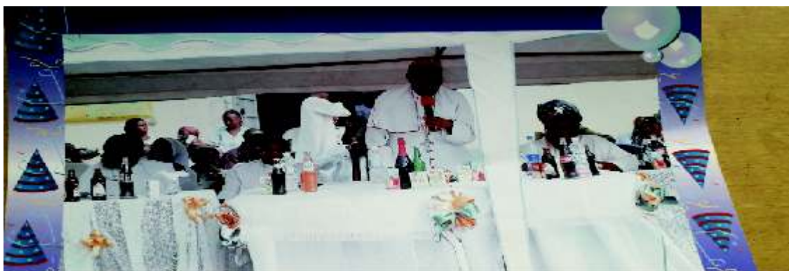
Plates 4i: Showing late Bishop A.O Makozi during his episcopal visit to Church of the Nativity