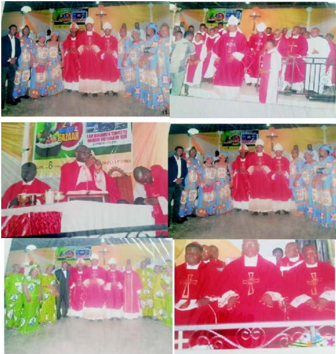
Plates 4m: Cross sections of the bishops during the CBCN visit to the parish in September 2015 on the feast day of St Cyprian.

In the month of September, 2015, the CBCN had their synod in Port Harcourt. One of the events to mark their stay in Port Harcourt was a tour round some selected parishes in the diocese. Church of the Nativity was among the selected parishes to host the bishops. This event took place on September 15, 2015.