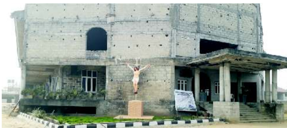
Plate 1b: Entrance view of the Parish church building