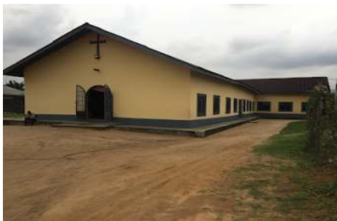
Plate 3c: The first church building standing completed.