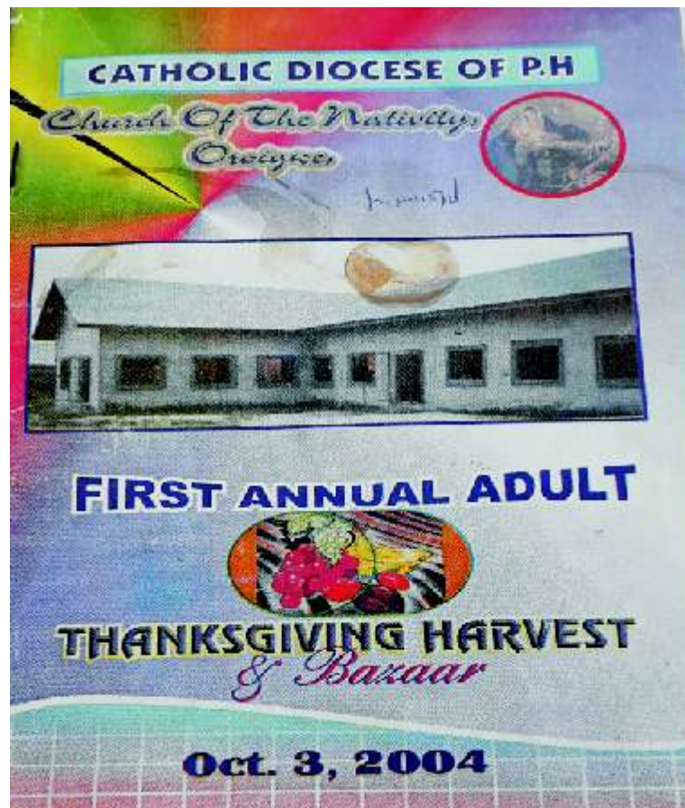
Extracted from the 2004 Harvest brochure (front cover page)

The first annual harvest and thanksgiving event took place on October 3, 2004. During that time, Church of the Nativity was still an out station. The harvest organizing committee was led by Sir Mike Obinor as chairman. The theme of the first harvest thanksgiving celebrated in 2004 was- Harvest of Gratitude