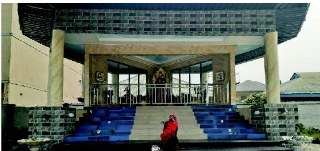
Plate 1a: The Grotto of our mother of Perpetual Help (A visible monument that characterizes the parish)

A visit into the parish premises greets you with a beautiful grotto of our Mother of Perpetual Help, a giant crucifix, an air of peace and an atmosphere of friendliness and God's divine presence.