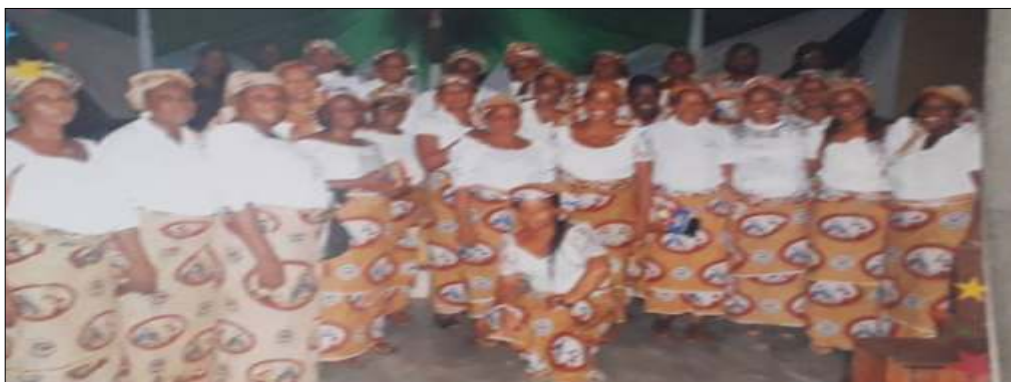
Plate 4q: Cross Section of members of ASHJIHM