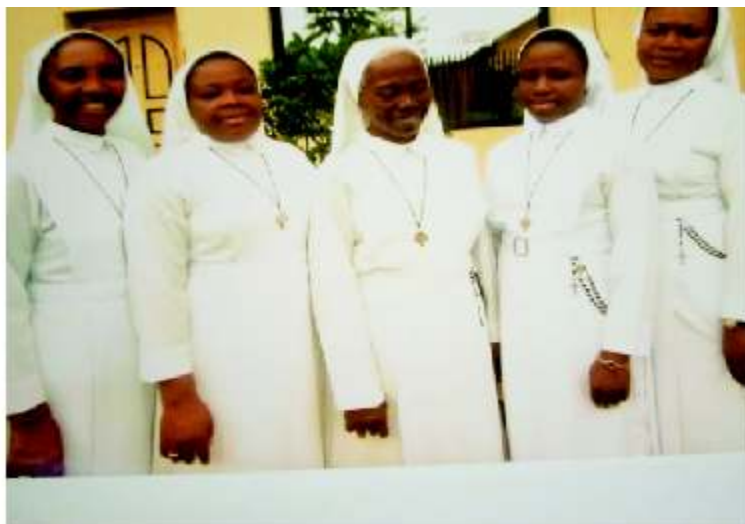
Plate 4h: The pioneer sisters of HHCJ that started the convent at the Church of the Nativity