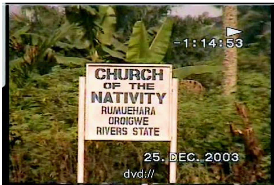
Plate 2a: A signpost leading to the new out station

On approaching the road leading to the church he noticed the sign post which had been erected for the purpose of the first holy mass on Christmas day and he exclaimed “ you have a church in here ” on seeing the sign post which read “Church of the Nativity, Rumuewhara, Oroigwe, Catholic Diocese of Port Harcourt”.