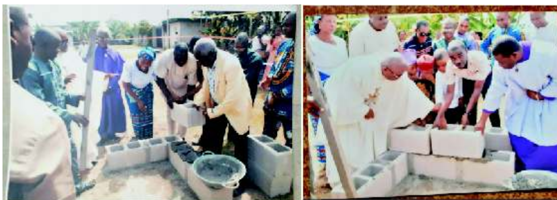
Plates 3j: In Photo are parishioners during the laying of foundation for the new church building with the parish priest and Vicar General of Catholic Diocese of Port Harcourt, Monsignor Cyprian Onwuli (December 2015)

Another interesting fact to note was that in January 2016, the new church project building committee was mobilized with the sum of one million naira only and 9,000 blocks to commence work. From this little beginning, the committee made gradual but steady progress up to roofing level in November 2019. The building of the new church is a demonstration of faith and a manifestation of God's goodness and the generosity parishioners to build a temple to honour the Lord, God.