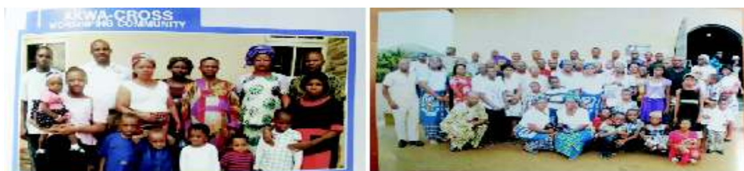
Akwa-Cross worshipping community