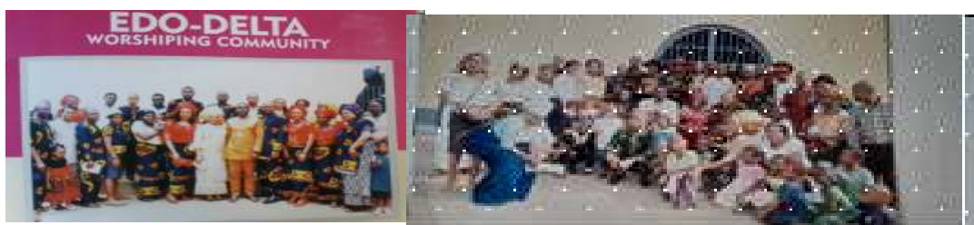
Members of Edo- Delta worshipping community