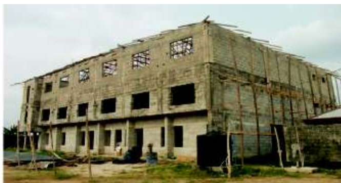
Plate 3h: Showing Church of the Nativity Parish hall under construction