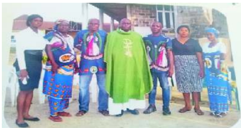
Plate 5: Cross Section of Divine Mercy devotees with Parish Priest.