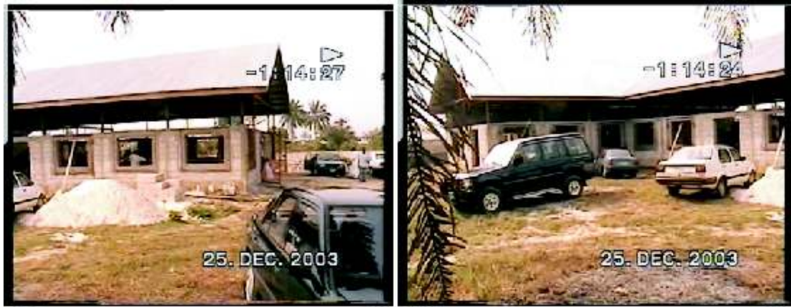
Plate 3a: The church building as at December 25, 2003