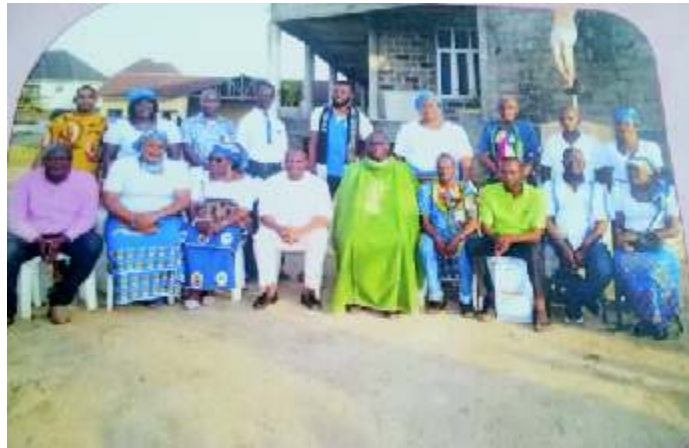
Plate 5a: cross section of pastoral council members