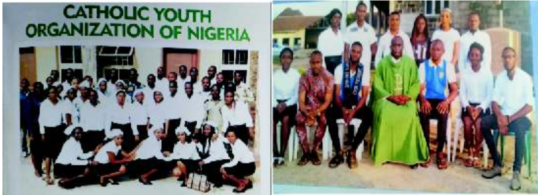
Plate 5d: Cross section of members of CYON, Church of the Nativity