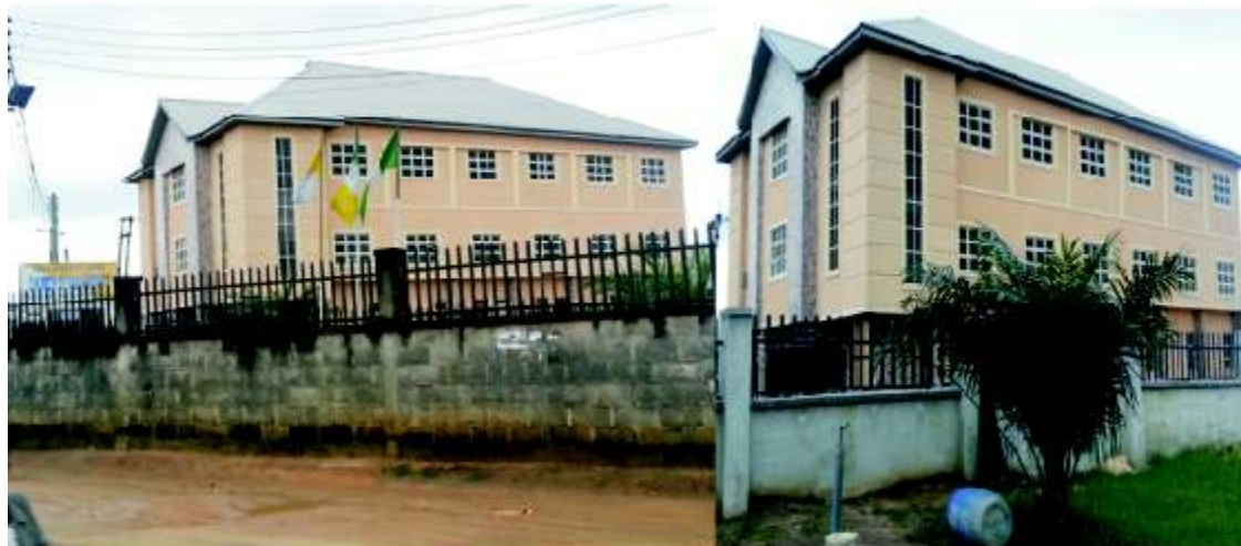
Plates 3i: Showing Church of the Nativity Parish hall completed for use