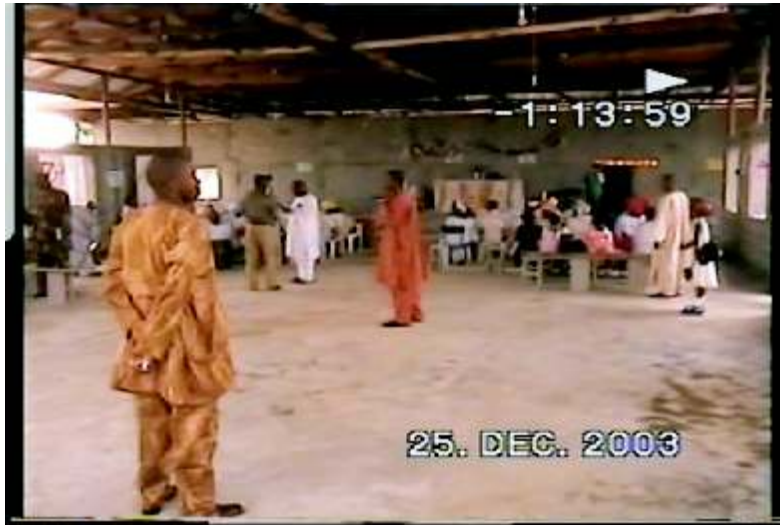
Plate 3b: During first holy Mass without chairs and pews