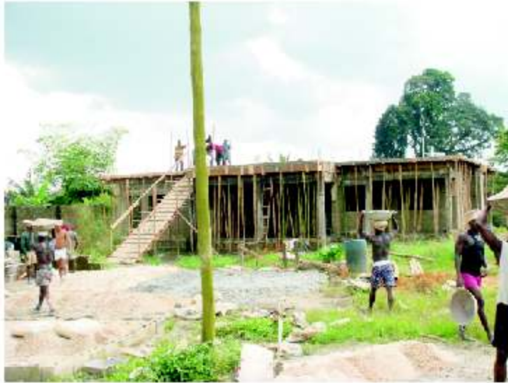
Plate 3e: showing ongoing construction work for the presbytery