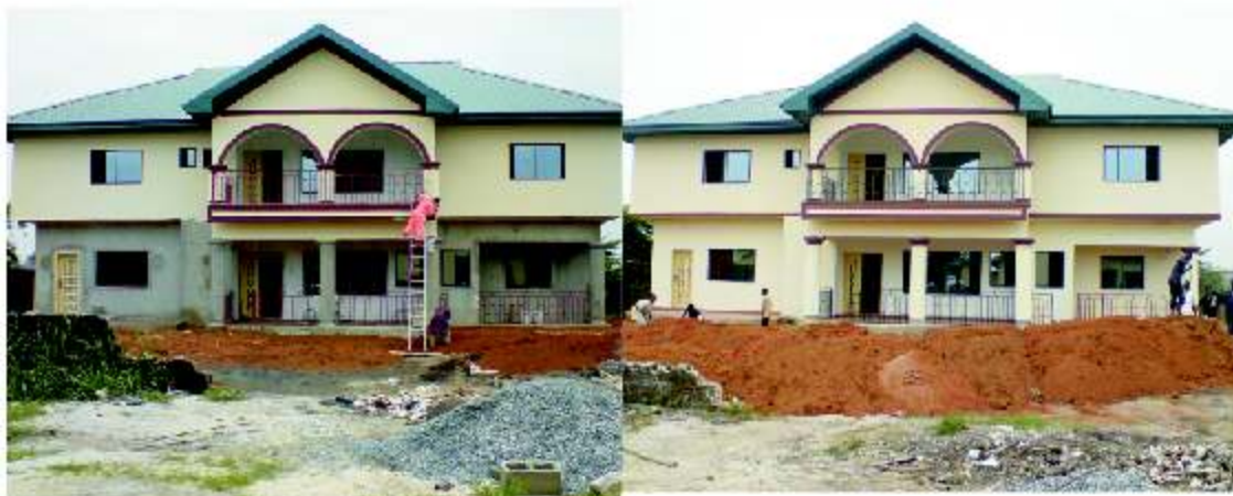
Plates 3f: Showing completion works and sandfilling of parish house premises with laterite The trucks that were used to sandfill the presbytery arena were provided by Engr. Emeka Otutu