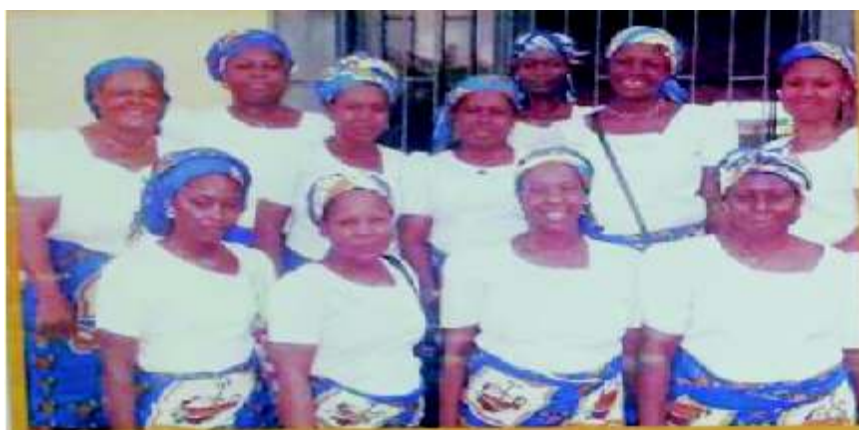
Plate 5b: Cross section of members of CWO, Church of the Nativity