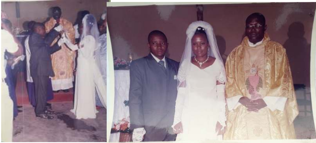
Plates 4n: Photo of first couple that wedded in the out station- Church of the Nativity, Rumuewhara, Oroigwe.

important to emphasize that the documentations and records of sacraments of holy matrimony administered in the Church of the Nativity started in the year 2007 following its elevation above an out station status.