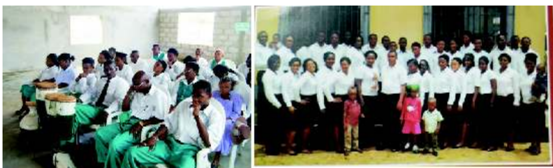
Plate 4u: Cross Section of Parish Choristers.