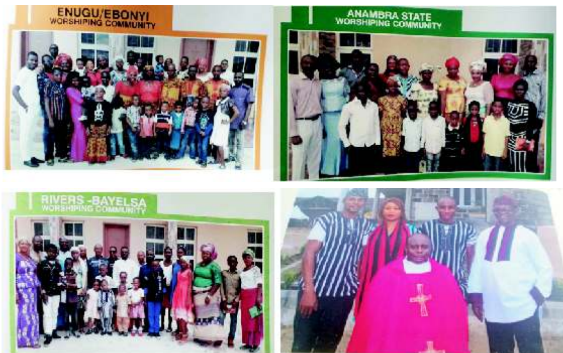
Middle Belt Worshipping Community