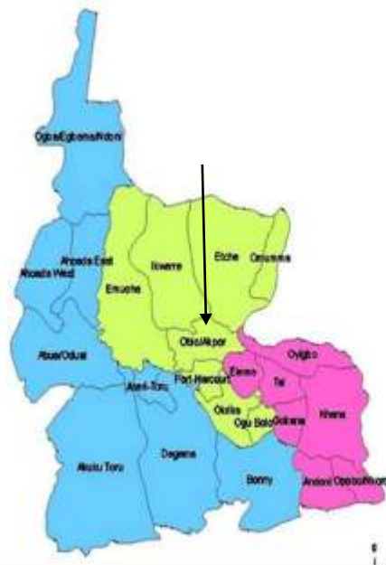
Figure 1. Map of Rivers State showing Parish location in Obio Akpor Local Government

The Church of the Nativity is among the 21st century and Millennium parishes created by and for the Catholic Diocese of Port Harcourt during the episcopacy of His Lordship, Bishop Alexius Makozi of blessed memory. The Church of the Nativity is situated in the Rumuewhara community in Oroigwe Kingdom of Obio-Akpor Local Government Area of Rivers State.